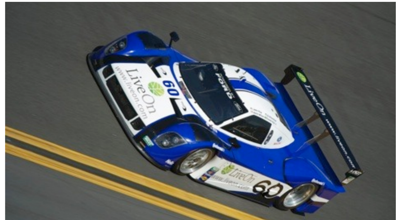
Shank cars dominate qualifying to capture front row

Michael Shank Racing with Curb/Agajanian has been working countless hours as the team prepares for the twice around the clock event in hopes that the efforts pay off with a solid showing from both cars and that 2012 will be their year to earn the Rolex 24 title. - see page 2